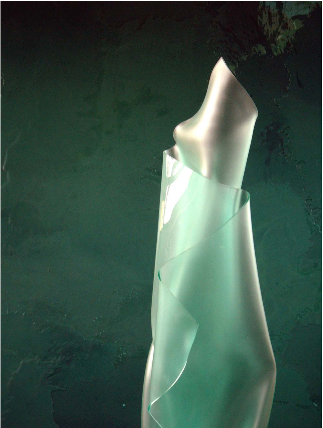
Ice Column , plexiglass sculpture, 150 x 70 x 75 cm Conceived as an ice skyscraper merging in a three-dimensional oeuvre with In the Woods , therefore placing the viewer as part of the artwork.